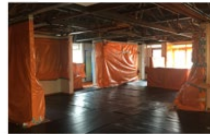
Previous project pictures